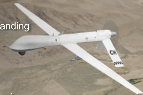
*Screenshot of SDS' MQ-1 Model and Database